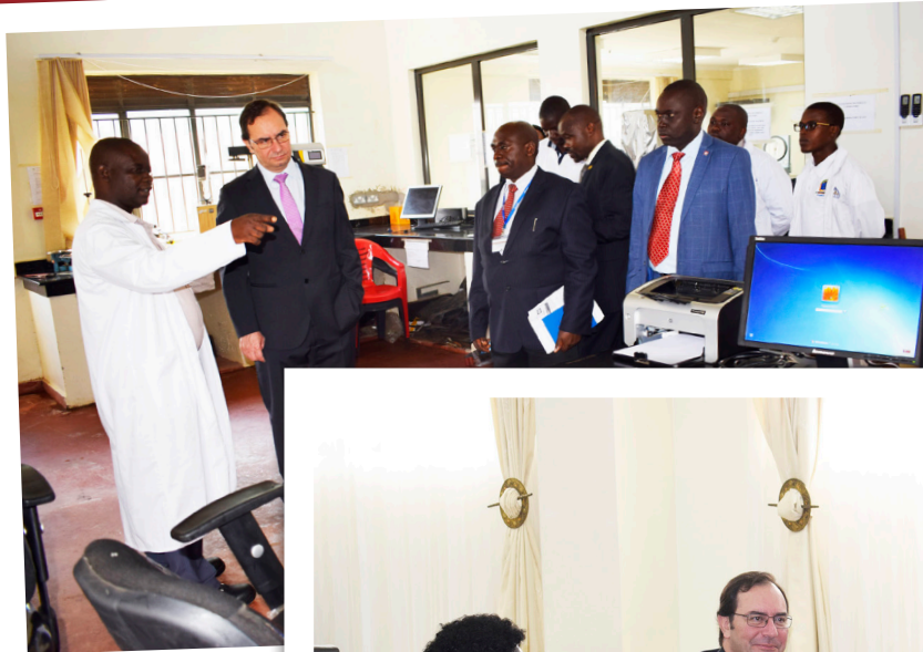
ISO SG on a tour of the materials lab