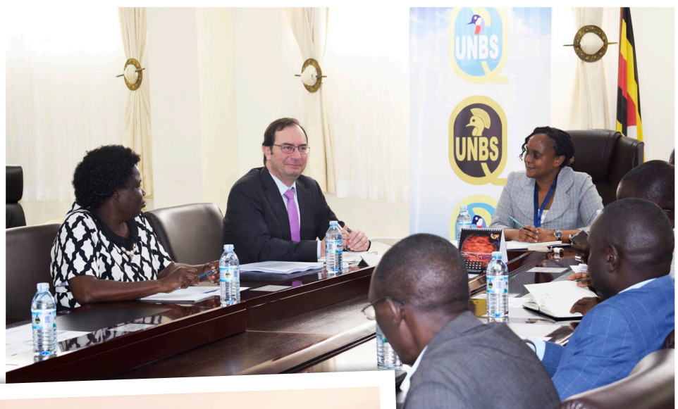
ISO SG meeting with Standards officers